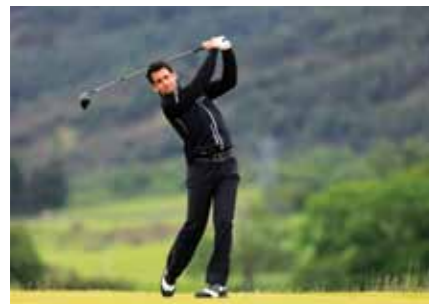
The Scottish Hydro Challenge MacDonald Spey Valley Golf Course Aviemore, 10th June - 13th June 2010