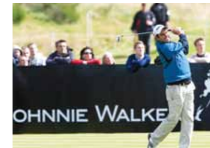
Johnnie Walker Championship PGA Centenary Course Gleneagles, 26th August - 29th August 2010