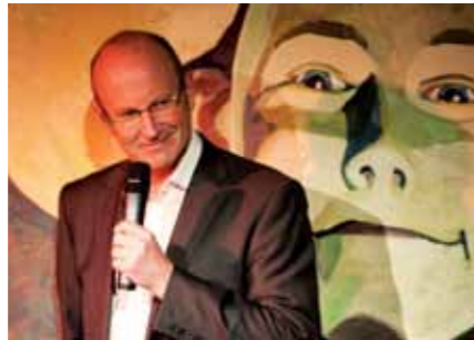
Glasgow International Comedy Festival 17th March - 10th April 2011