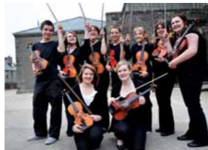
The Royal National MOD Stornoway, 10th October - 18th October 2010