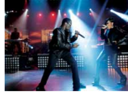
MTV Crashes...Glasgow 29th September 2010