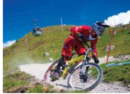
The UCI Mountain Bike World Cup Fort William, 5th June - 6th June 2010