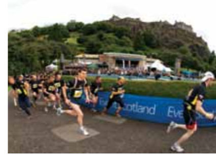
The Rat Race Urban Adventure Edinburgh, 17th July - 18th July 2010