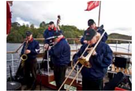
The Callander Jazz and Blues Festival 1st October - 3rd October 2010