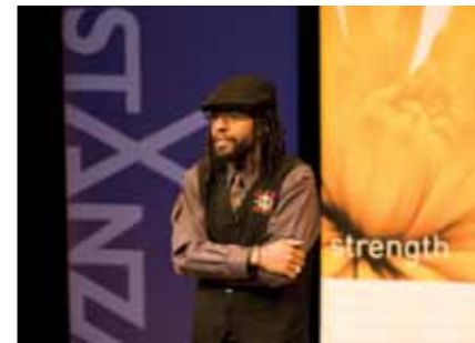
STAnza, Scotland's International Poetry Festival, St Andrews 16th March - 20th March 2011