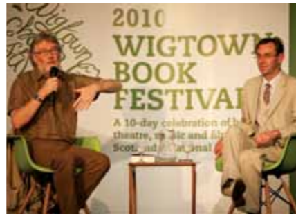
The Wigtown Book Festival Dumfries and Galloway 24th September - 3rd October 2010