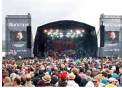
RockNess Inverness 12th June - 14th June 2010