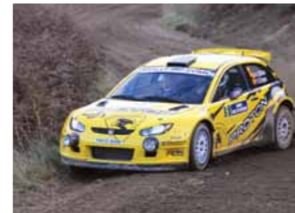
RACMSA Rally of Scotland Stirling and Perthshire 15th October 2010 - 17th October 2010