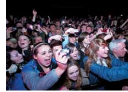
Loopallu Ullapool 17th September - 18th September 2010