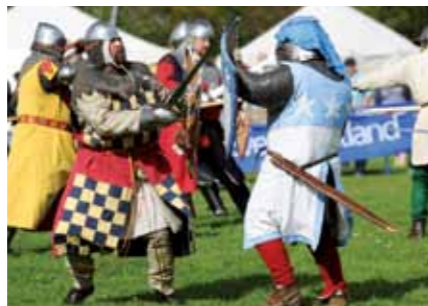
Scotland's Festival of History Lanark, 21st August - 22nd August 2010