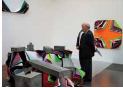
Glasgow International Festival of Contemporary Arts, 16th April - 3rd May 2010