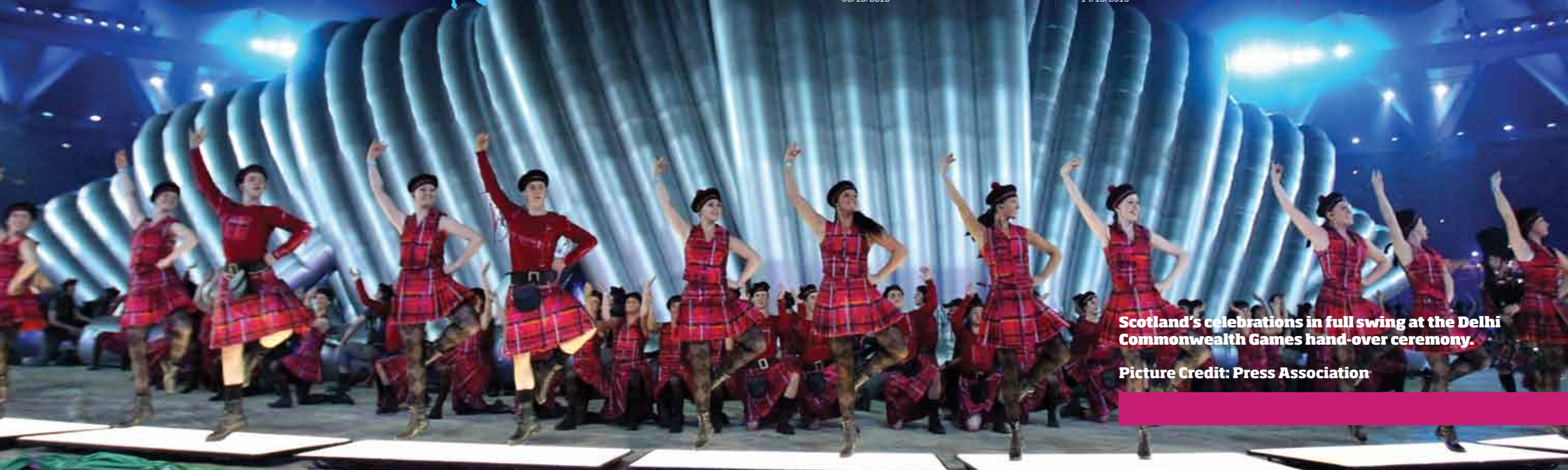
Scotland's celebrations in full swing at the Delhi Commonwealth Games hand-over ceremony.