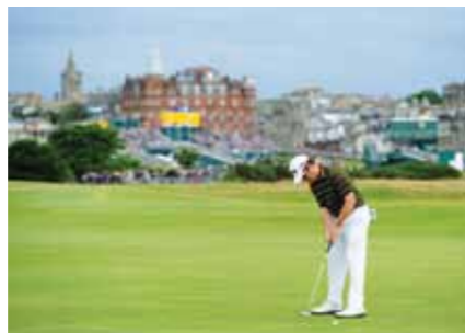
The Open Championship The Old Course St Andrews 15th July - 18th July 2010