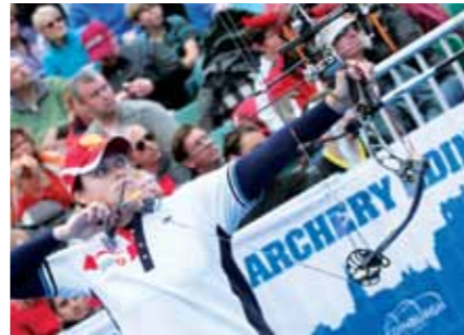
The FITA Archery World Cup Edinburgh 18th September - 19th September 2010