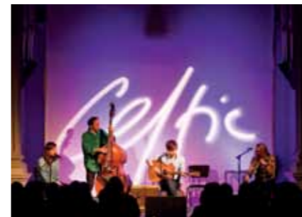
Celtic Connections Glasgow, 13th January - 30th January 2011