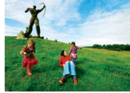
The Wickerman Festival Dumfries and Galloway 23rd July - 24th July 2010