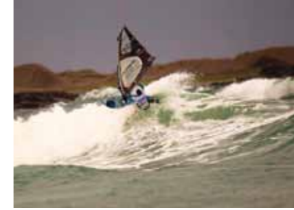
The Tthree Wave Classic 9th October - 15th October 2010