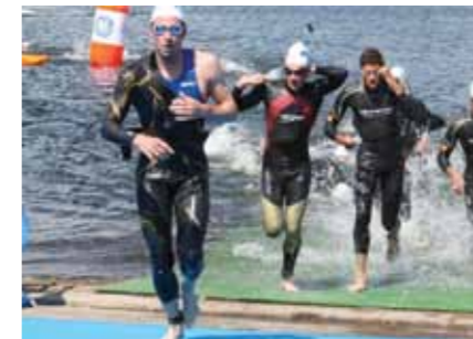
GE Strathclyde Park Triathlon North Lanarkshire, 23rd May 2010