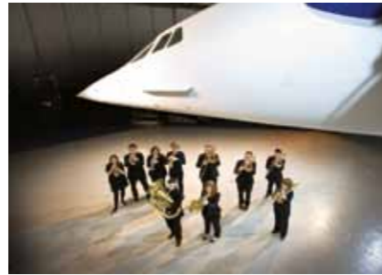
The Lammermuir Festival East Lothian 10th September - 19th September 2010