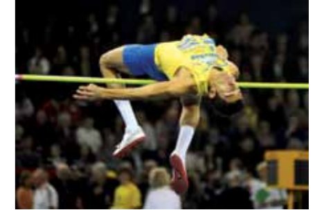
Aviva International Match Glasgow, 29th January 2011