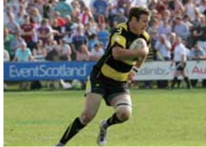
The Melrose Sevens 10th April 2010