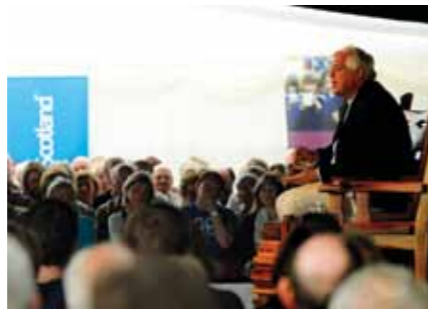
The Borders Book Festival Melrose 17th June - 20th June 2010