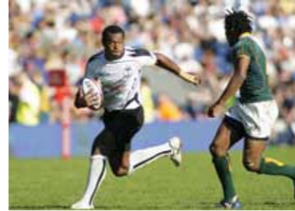
The Emirates Airline Edinburgh 7s 29th May - 30th May 2010