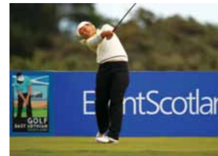
The Aberdeen Ladies Scottish Open Archerfield Links, East Lothian 18th August - 20th August 2010