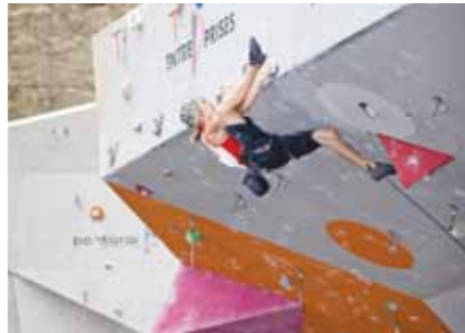
The IFSC Climbing World Youth Championships Edinburgh 9th September - 12th September 2010