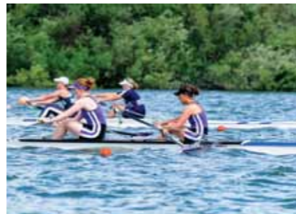
British Rowing Championships North Lanarkshire, 16th July - 18th July 2010