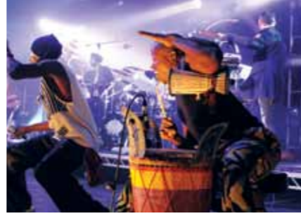
Hebridean Celtic Festival Western Isles 14th July - 17th July 2010