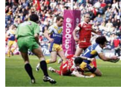
Engage RFL Magic Weekend Edinburgh, 1st May - 2nd May 2010