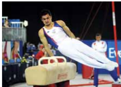
Glasgow Grand Prix World Cup 18th November - 21st November 2010