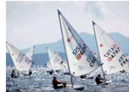
The Laser Radial World Championships Largs 7th July - 25th July 2010