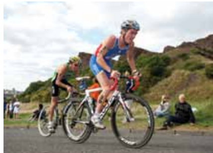
The 2010 ITU Duathlon World Championships Edinburgh 3rd September - 5th September 2010