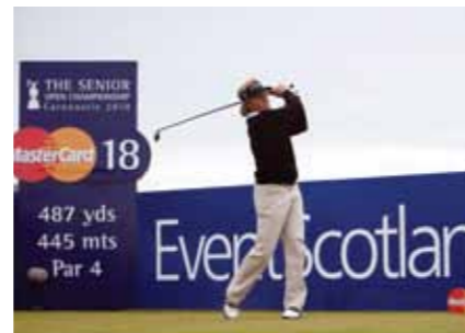
The Senior Open Championship Carnoustie 22nd July - 25th July 2010