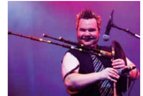
Piping Live! Glasgow, 9th August - 15th August 2010