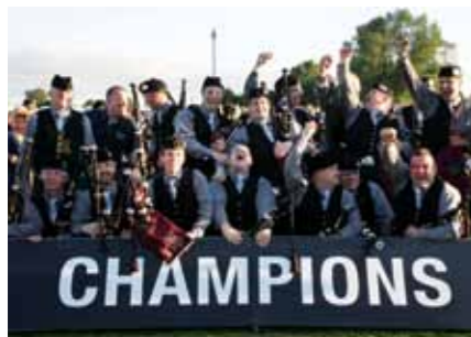
World Pipe Band Championships Glasgow, 14th August 2010