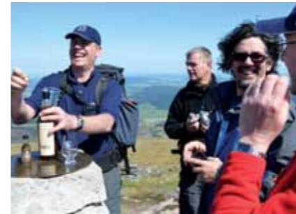
Spirit of Speyside Whisky Festival Across Moray, 29th April - 3rd May 2010