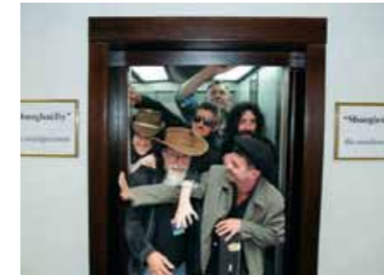
Burn's an' a' that! Festival Ayr, 27th May - 30th May 2010