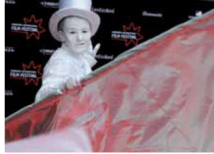
The Edinburgh International Film Festival 16th June - 28th June 2010