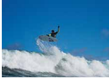
The O'Neill Cold Water Classic Thurso, 13th April - 20th April 2010