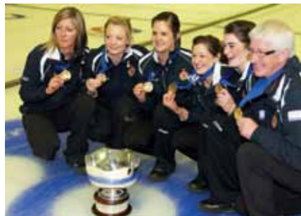
The World Junior Curling Championships Perth, 5th March - 13th March 2011