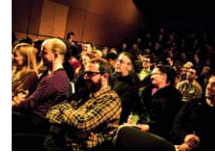
Glasgow Film Festival 17th February - 27th February 2011