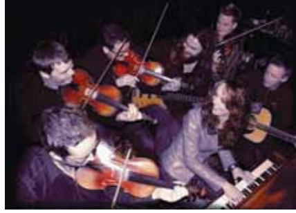
The Shetland Folk Festival 29th April - 2nd May 2010