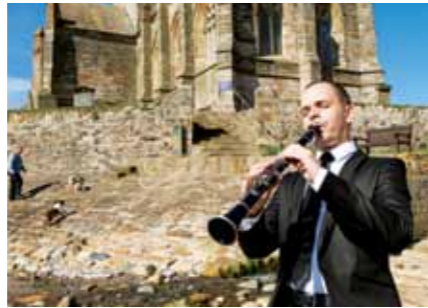
East Neuk Festival Fife 30th June - 4th July 2010